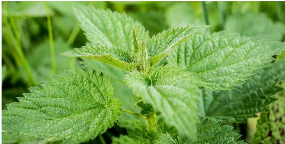
2-figure: Nettle. Urtica L

The seeds of the flax plant (flax) are a very effective and non-intestinal laxative. The effect is based on the ability of the seeds to swell with additional fluid in the colon. By increasing the volume of bowel movements, digestion becomes easier and faster. It is suitable for long-term use and therefore can be used for preventive purposes. If necessary, mix 1 tablespoon of crushed or whole flaxseeds into yogurt or muesli 2-3 times a day, or swirl in orange juice. Drink plenty of fluids to do this, because otherwise the intestines can become gelatinous.