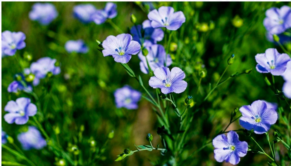
3-figure: Linum usitatissimum L

The seeds of the flax plant (flax) are a very effective and non-intestinal laxative. The effect is based on the ability of the seeds to swell with additional fluid in the colon. By increasing the volume of bowel movements, digestion becomes easier and faster. It is suitable for long-term use and therefore can be used for preventive purposes. If necessary, mix 1 tablespoon of crushed or whole flaxseeds into yogurt or muesli 2-3 times a day, or swirl in orange juice. Drink plenty of fluids to do this, because otherwise the intestines can become gelatinous.