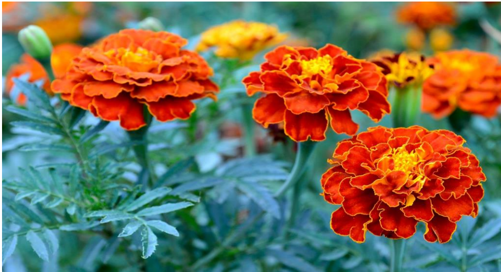
3-figure: Tagetes erecta.